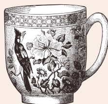
Tasse à thé