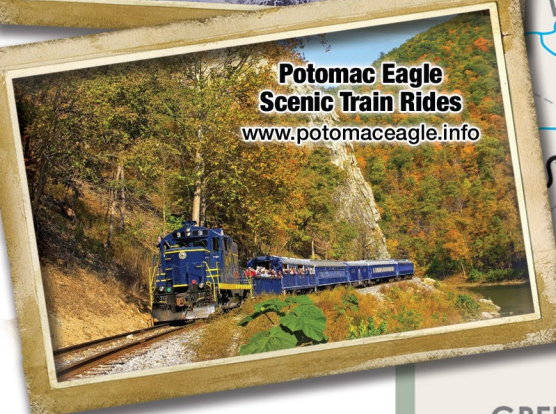
Potomac Eagle Scenic Train Rides www.potomaceagle.info