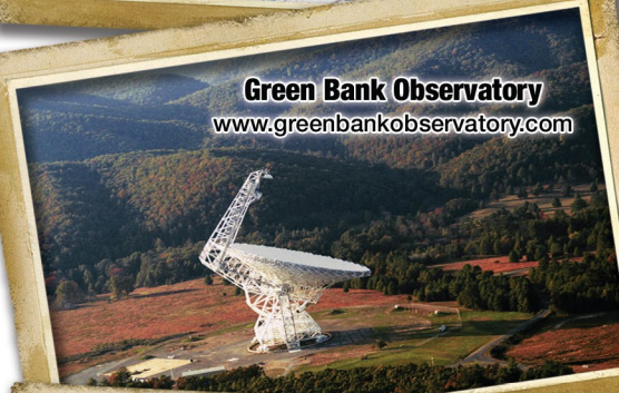
Green Bank Observatory www.greenbankobservatory.com