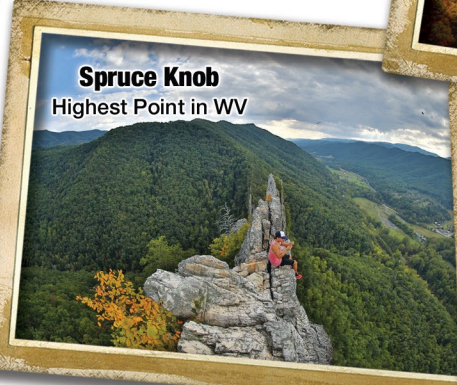
Spruce Knob Highest Point in WV