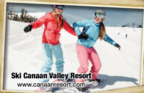
Ski Canaan Valley Resort www.canaanresort.com