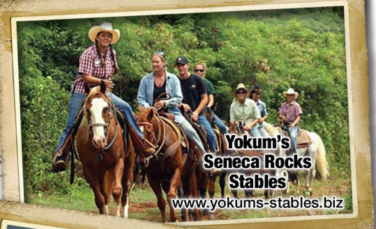
Yokum's Seneca Rocks Stables www.yokums-stables.biz