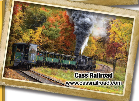
Cass Railroad www.cassrailroad.com

GPS Address: 8290 N Fork Hwy. • Cabins, WV 26855