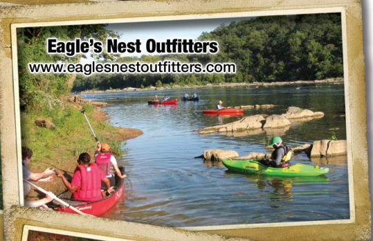
Eagle's Nest Outfitters www.eaglesnestoutfitters.com