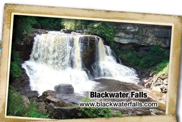
Blackwater Falls www.blackwaterfalls.com

This map is intended for general reference and trip planning.