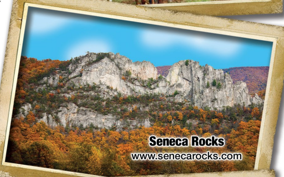
Seneca Rocks www.senecarocks.com