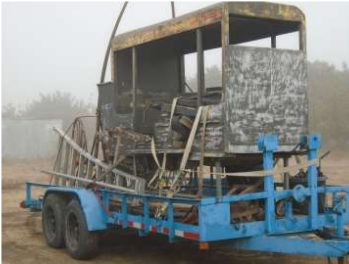
Mud wagon strapped down