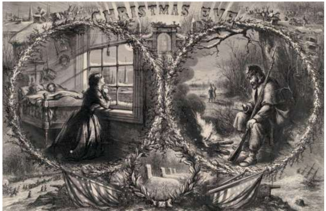
Christmas Eve, Harper's Weekly, January 3, 1863