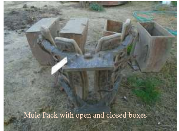
Mule Pack with open and closed boxes

A great many thanks to all who were able to help with the Warhorse clean out and Duncans Mills set up. At the end of this day, there was still a little clean up to do but not very much.