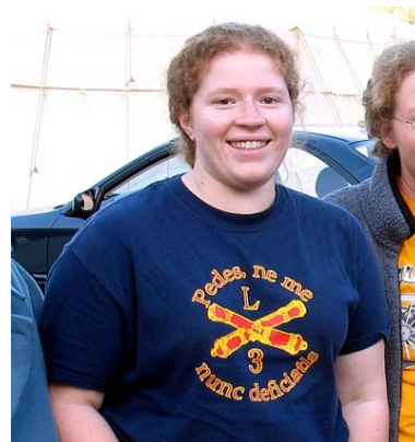
"Pedes ne me" t-shirts! $15.