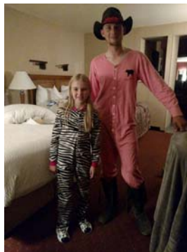
Pajama Party on Friday night