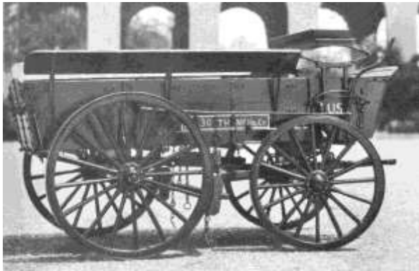
Not our wagon, merely a picture

Anyone with a museum contact is encouraged to contact a board member.