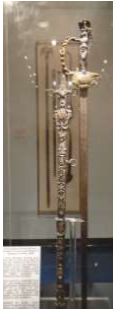
General Sherman's sword