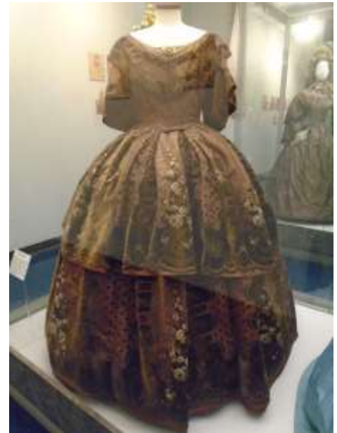
Fashion through the time.