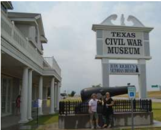
White Settlement, Texas (nothing politically incorrect about that name)