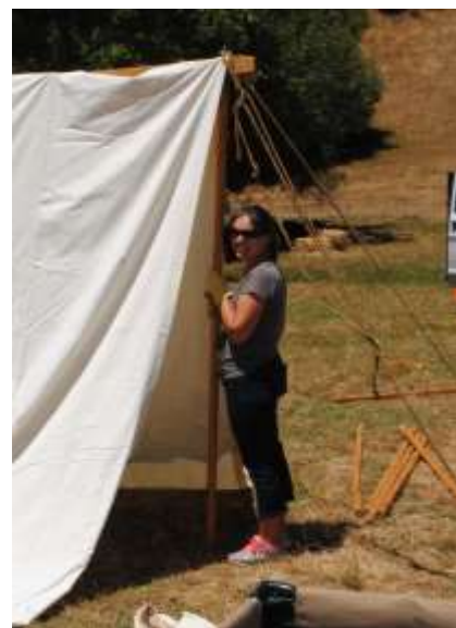
Reb camp filling