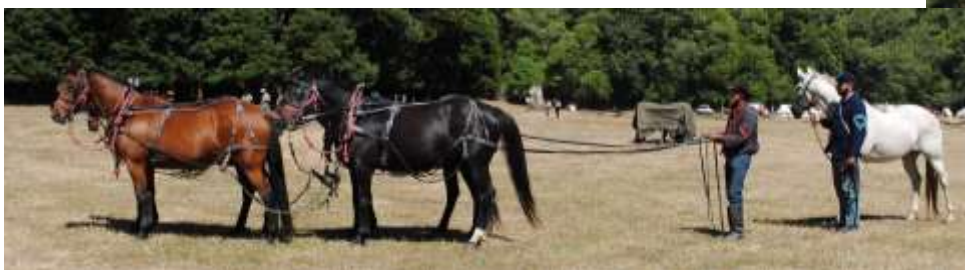
Civilians and Suttlers arriving