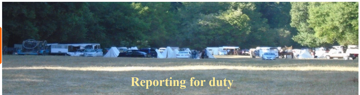
Reporting for duty