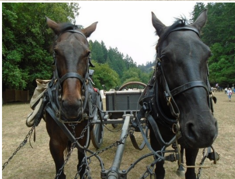
Wheel team selfie.