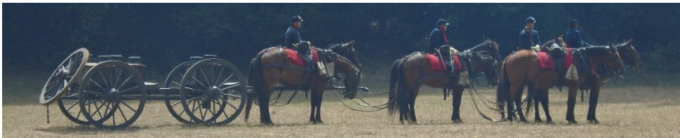
Caisson got to show off.