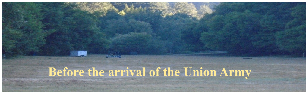
Before the arrival of the Union Army