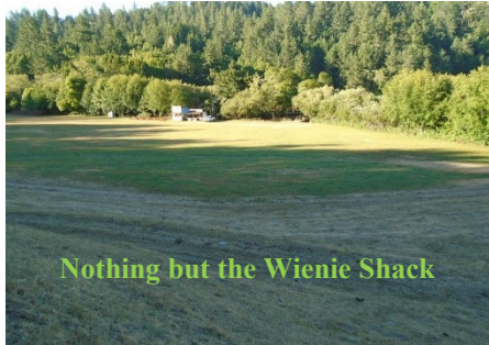
Nothing but the Wienie Shack