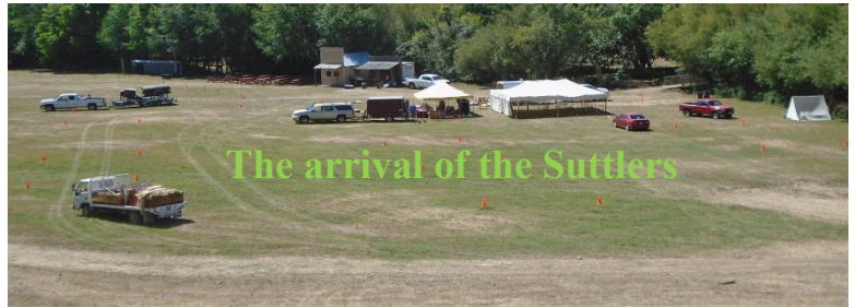
The arrival of the Suttlers