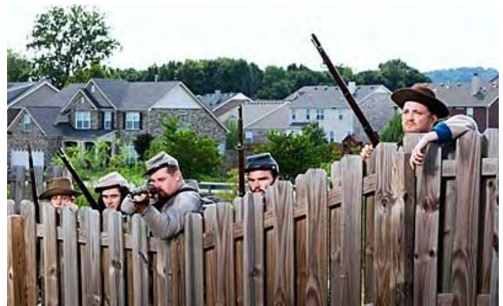
Spring Hill, Tn

These pictures ask us to remember that it happened right here—right where our car slowly drips transmission fluid onto the vast parking lot outside Staples, or where we stand and drink a beer with the neighbors while steaks sizzle on the shiny new gas grill and kids thumb their new Xbox controllers in the basement. And they tell us it could never happen again. We're too busy shopping.