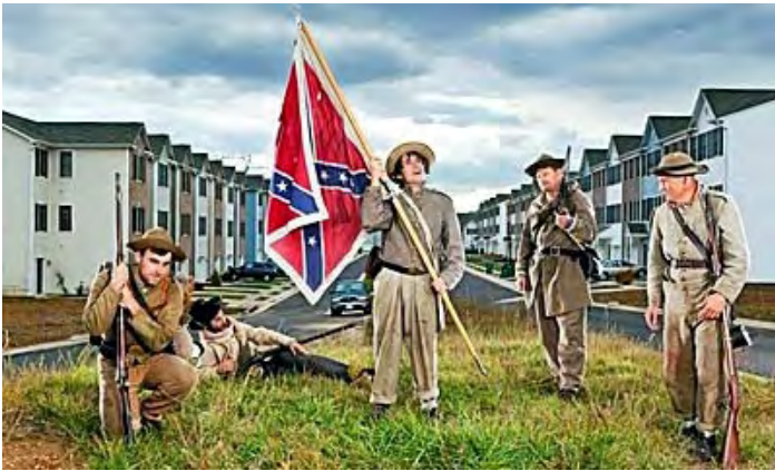
Locust Grove, Va.

"The past is never dead," wrote William Faulkner of Oxford, Mississippi. "It's not even past." In Europe, they know this. Modern apartment buildings in Rome are built on Renaissance foundations that in turn contain bits of ruins that are thousands of years old. In Germany it's not unusual for a work site to shut down, or for a neighborhood to be evacuated, after the discovery of an unexploded bomb from World War II.