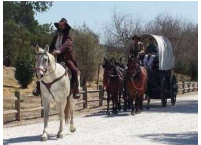
Outrider for the supply wagon at Tres Pinos.

Steele knows several tricks. He can bow, fetch and rear, all on command.