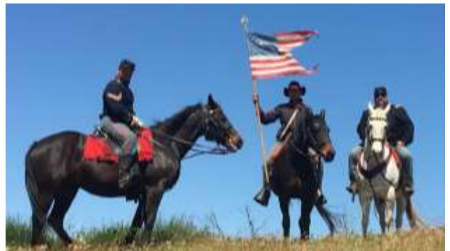
Grasshopper, Gumdrop and Steele at Moorpark.