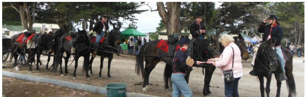
2015 event—visiting with the public and showing off the horses.

Contact Dee Murphy momagna@yahoo.com 408-899-6456