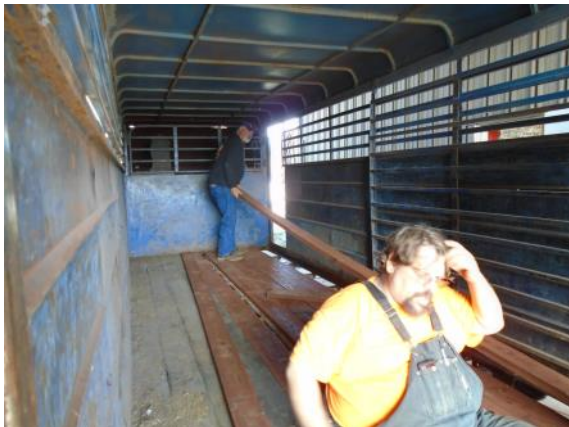
Blue horse trailer has a new floor. Paint job is in progress.