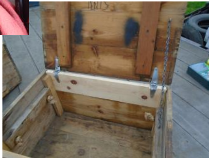
Tent boxes given new boards.