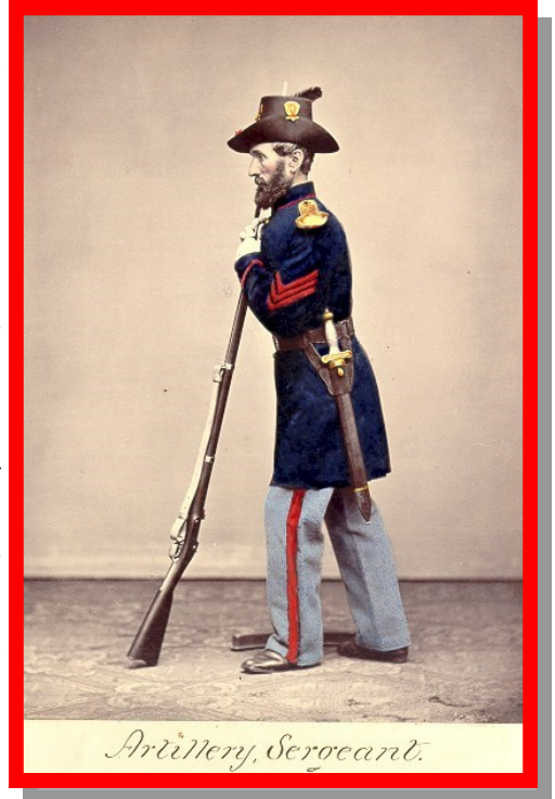
Foot Artillery sergeant in full dress uniform, very similar to an infantryman, per 1862 regulations. Artillerymen of the 3 rd U.S. Artillery would have worn this uniform, but with dark blue trousers, while in California before the Civil War. Note the unique – and essentially useless – short sword issued to foot artillerymen. As with many uniform and equipment items of the period, this was a copy of the sword issued to French artillerymen.

The additional officers and non-commissioned officers were authorized for mounted batteries fielding six guns, which became the wartime standard for the Union mounted batteries from late 1861 until mid to late 1864, when many reverted back to four-gun batteries. Three of the lieutenants commanded sections of two gun detachments each, and one lieutenant commanded the caissons and performed staff duties for the battery. The six sergeants were chiefs of pieces. Six of the corporals were gunners and six were chiefs of the caissons.