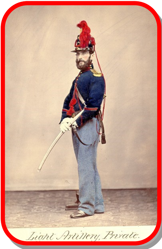
Light Artillery, Private.

Companies C, G, H, L, and M of the 3 rd U.S. Artillery were dispatched from California in October 1861 to New York to join Companies E and F in the war effort back east. Company M was attached to Company L and they were reequipped as a consolidated mounted battery with six 10 lb. Parrott rifles. Initially assigned to the Army of the Potomac, Batteries L&M, 3 rd U.S. Artillery, would serve in both the eastern and western theaters of the war: from the siege of Yorktown in April-May 1862 through to the Fredericksburg campaign in December 1862; transferring to Kentucky and campaigning in the west through the siege of Vicksburg and into Mississippi and eastern Tennessee until March 1864; returning east to the Army of the Potomac to fight in the Wilderness campaign in May 1864; and finally finishing out the last year of the war as part of the defenses of Washington, DC.