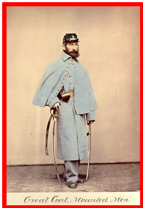
Great Coat, Mounted Men

Light Artillery private in full dress uniform, per 1861 regulations. The ornate shako was unique to the light artillery companies and a holdover from an earlier era. Artillerymen in Batteries L&M would have worn this uniform, substituting the forage cap for the shako in the field, once they were reequipped as light artilleryman in late 1861.