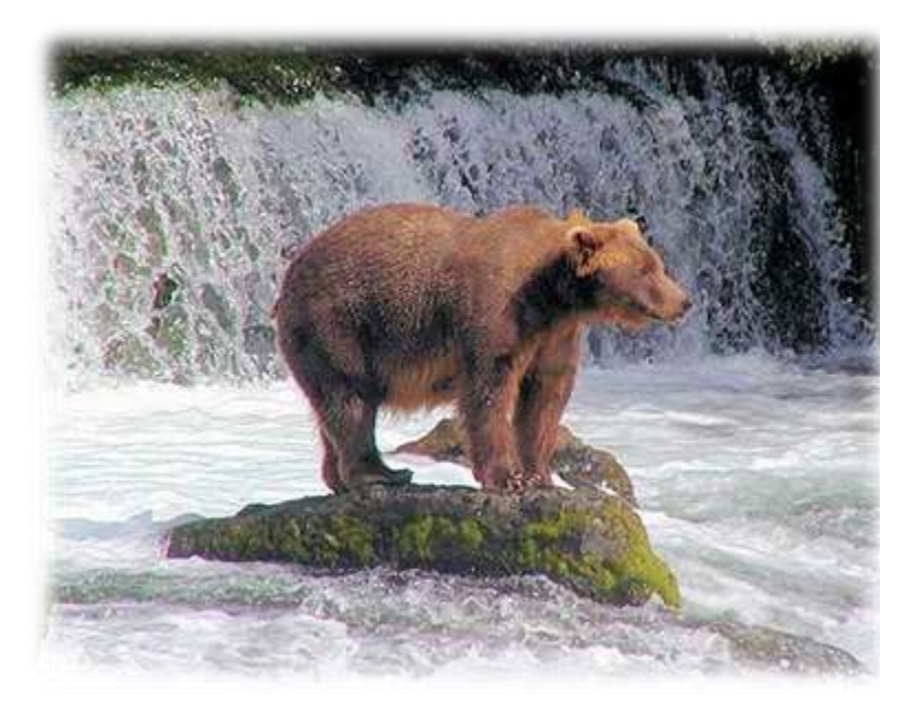
Bears at Katmai National Park

To explore some of your wedding reservation options visit <u>Wedding Packages | Bear Paw</u> <u>Adventure</u> To request information, email: <u>alaska@bearpawadventure.com</u> or call.