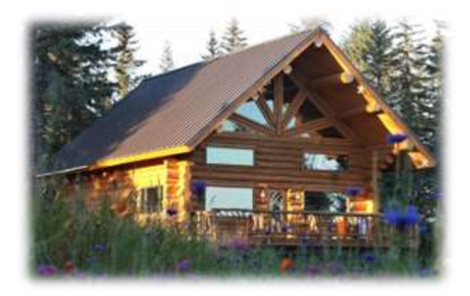
The Captain Cook Lodge

Lodging for your guests : We invite your guests and the members of the wedding party to stay with us in our unique, first-class log homes. In total, we can lodge up to 31 people in our four buildings.