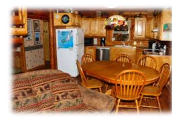
Kitchen at the Wise Old Hunter Lodge