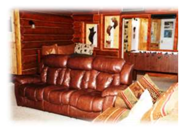
Bear Den Family Room

Please visit our website for information about our lodging. After you make your venue reservation, we will provide a discount code for your guest that they can use in our online system to make their reservation. Or they can call us anytime at 866 286 0576.