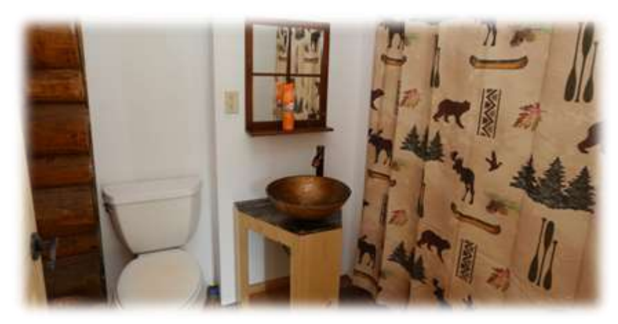
Bridal Suite Bathroom

Upon entrance to the Bridal Suite area from the Bear Den's family room, you first step into as small entry room that connects the family room with the bedroom chamber and the bridal suite's bathroom. There is a fourth door that opens to outside and to a raised deck where the couple can enjoy their morning coffee,