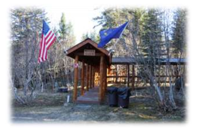
Moose Cabin Entrance